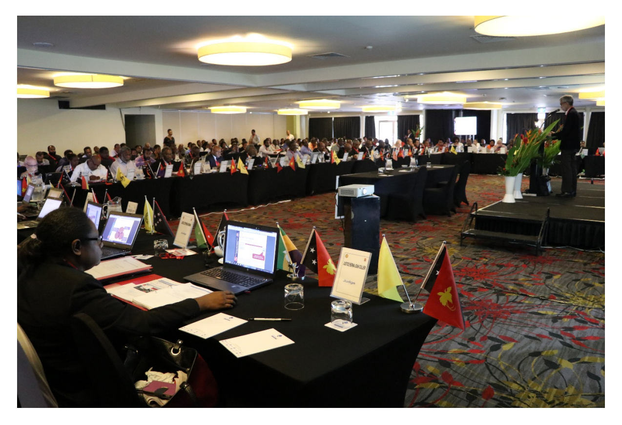
Workshop for Provincial Judges, Administrators, Provincial Judges, Associates, Assistant Registrars, Administration Officers and Clerks of Sub Registries – 12 July 2017